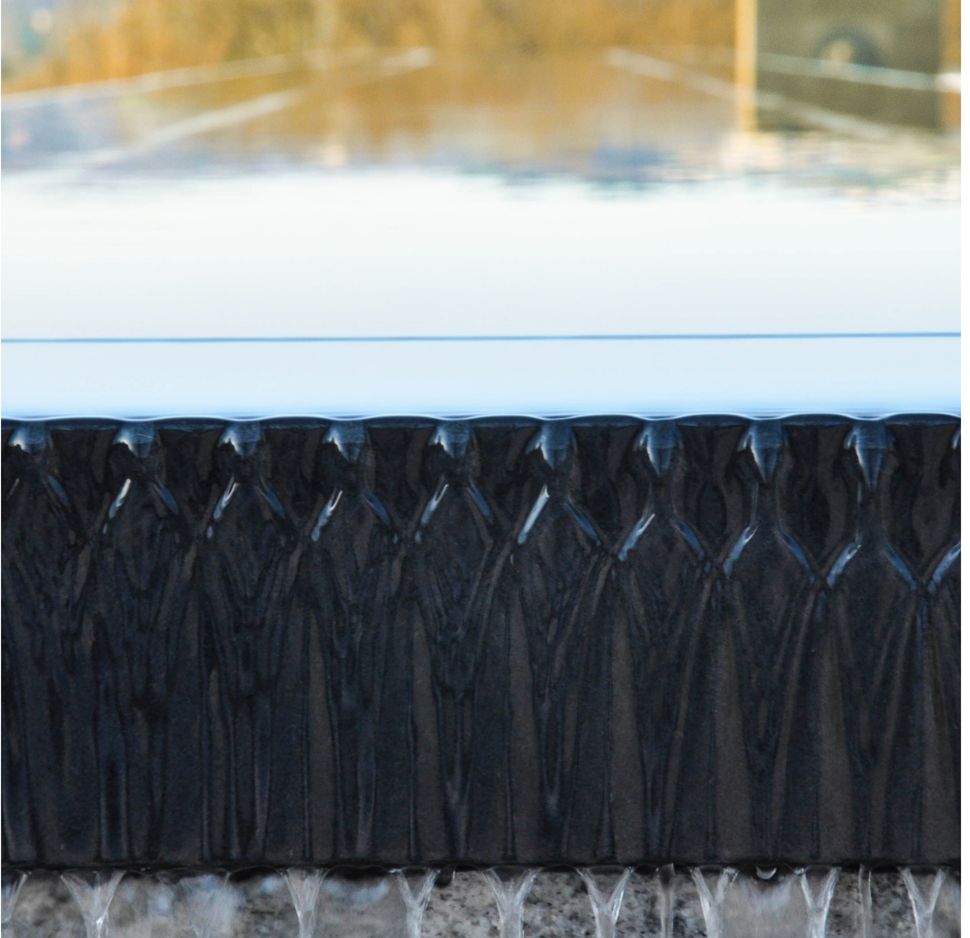
INFINITY FOUNTAIN, BINGHAMTON UNIVERSITY